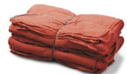
Cloth Shop Towels

No Toxins No Metal Remnants Clean Towel Every Time