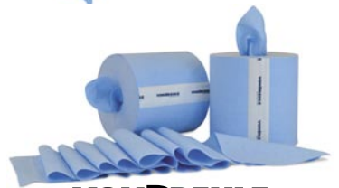
VONDREHLE #52W250 Centerpull Towels

No Toxins No Metal Remnants Clean Towel Every Time