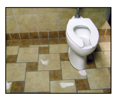
No Perforations Keeps the restroom environment cleaner

von Drehle's Jumbo Roll Tissue Systems provide a cost-effective, sanitary solution for high-traffic locations, and the high capacity rolls reduce maintenance demands as well as the possibility of run-outs.